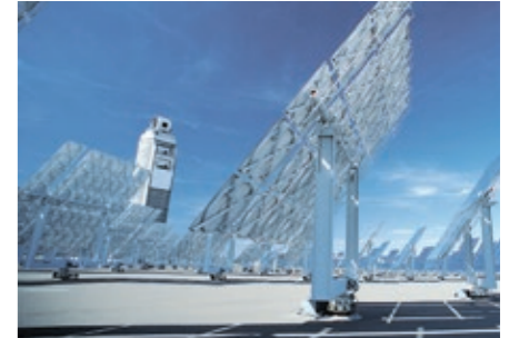
High safety standards with PV systems

The multi-stripax® stripping units can be exchanged flexibly, thus allowing you to insulate a wide range of special cables with ease using one tool and the appropriate sets of blades. This way, you always achieve a high level of quality.