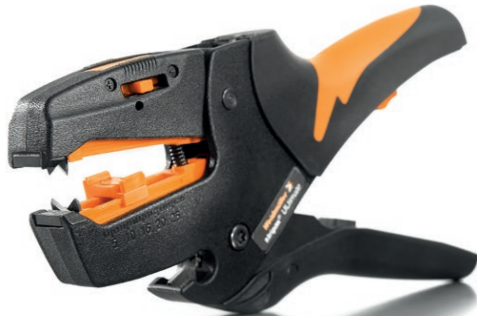
stripax® ULtimate Order no. 1468880000