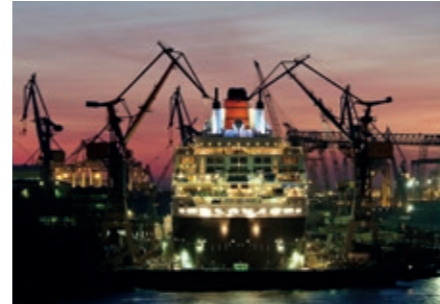
Fulfilling the most exacting demands in terms of ship and marine cables

New components, improved materials and precisely matched parts make stripax® ULtimate an especially robust stripping tool with which you can completely satisfy professional requirements.