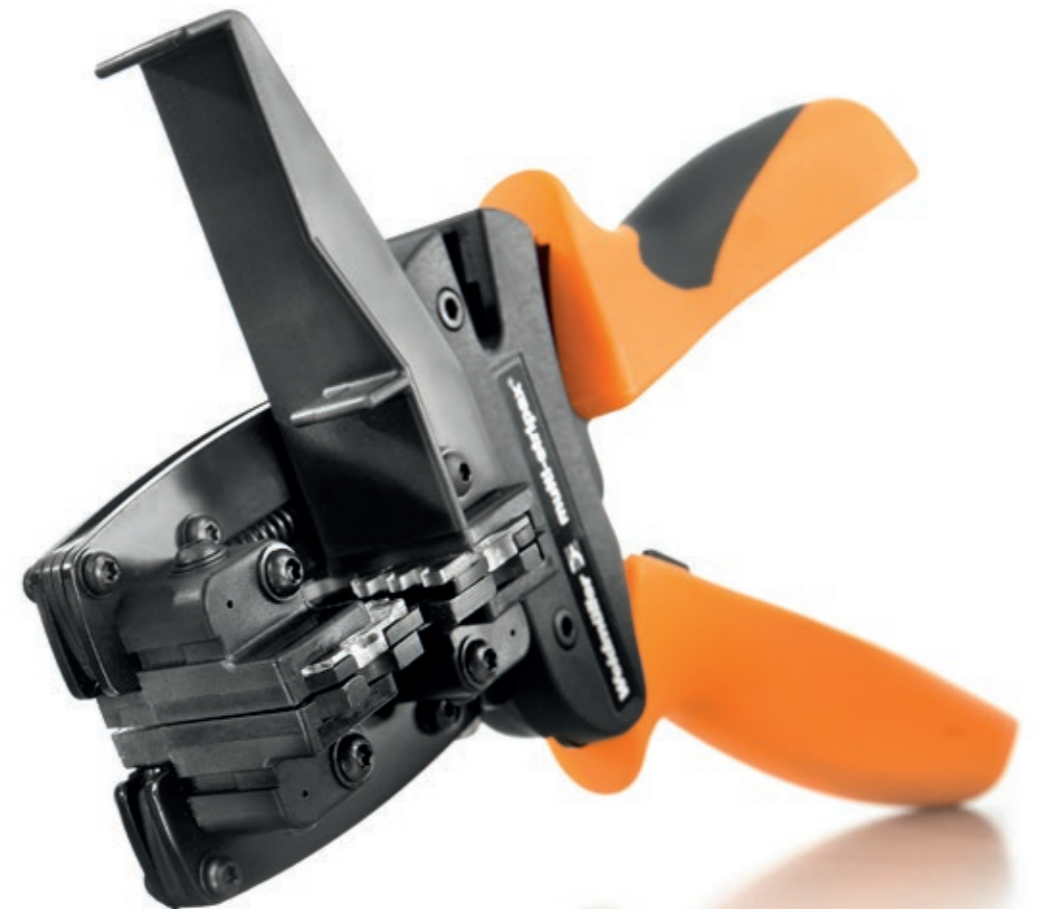
multi-stripax® PV Order no. 1190490000