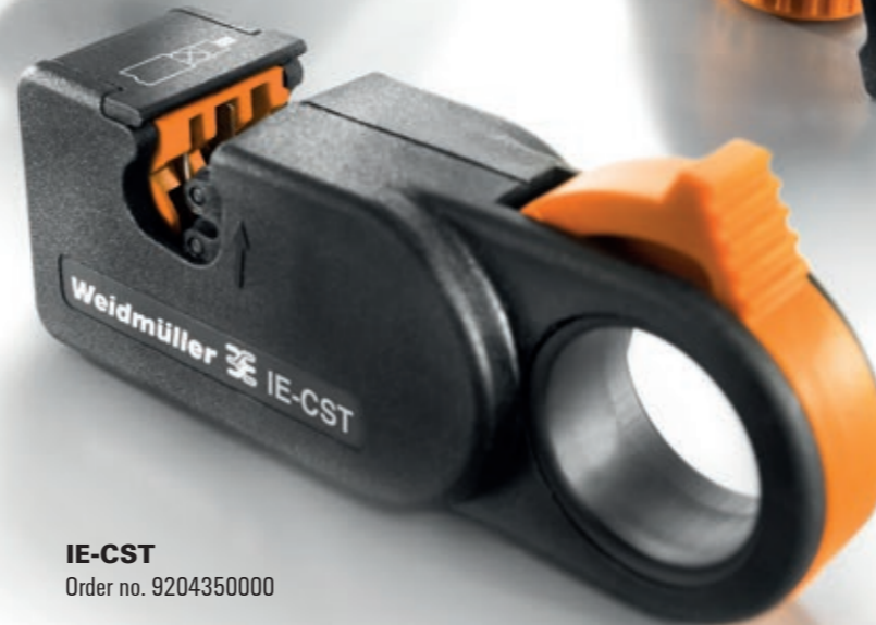
IE-CST Order no. 9204350000